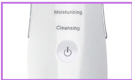
One touch button controls varying modes