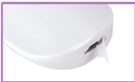
USB charging jack with covering