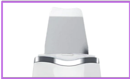
Cleaning head allows for deep pore cleaning